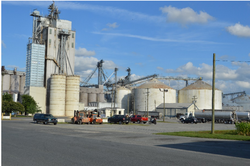
The Mountaire poultry plant in Millsboro, Delaware, whose owners have been sued for contaminating the drinking water wells of neighbors with nitrates and bacteria