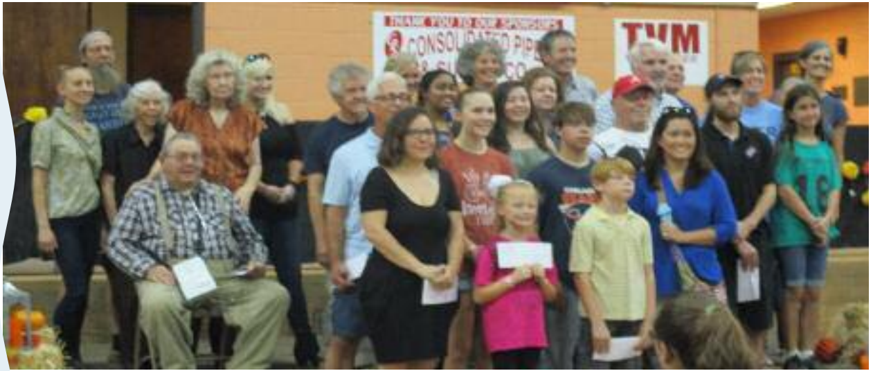
Art and Photo Contest winners - Awards Ceremony on September 12, 2018